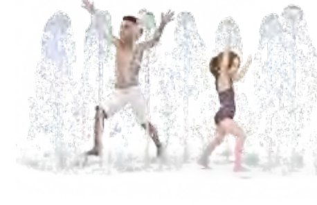
S Configuration Pop Jet