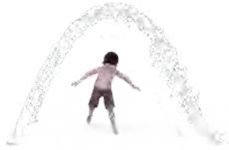
Arch Jet: 4 Spray