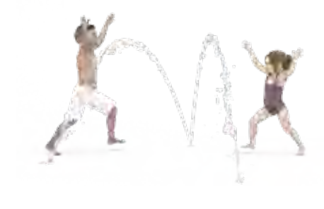
Split Arch Jet