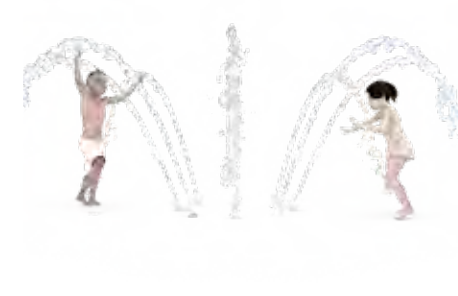
Circular Arch Jet