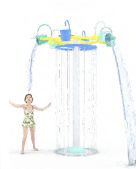
Tippy Buckets with Downjets