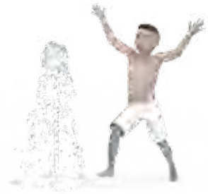
Pop Jet: Low Flow