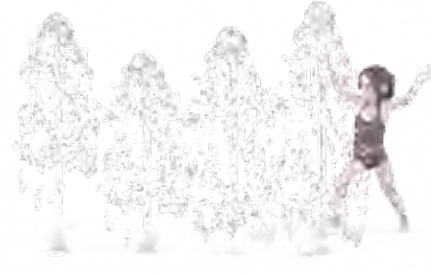
Pop Jet: 4 Spray