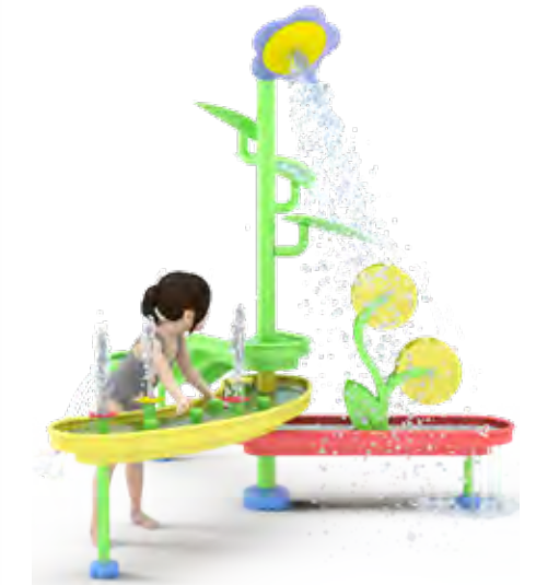
Water Trough Garden