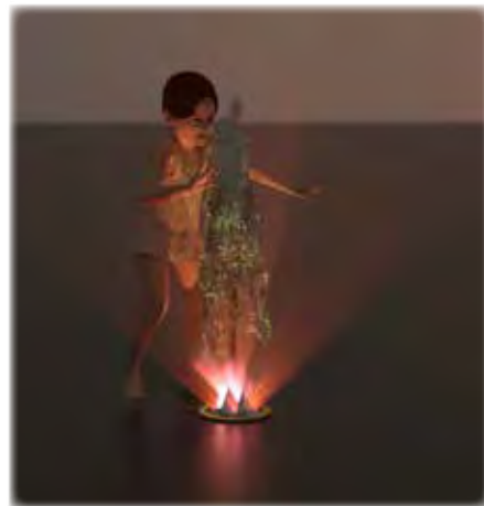
LED Gusher Jet