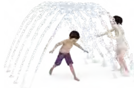
Arch Jet: 6 Spray