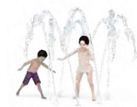
Spiral Arch Jet