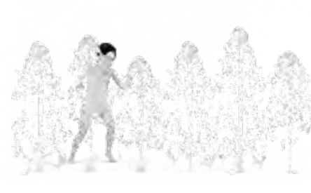
Pop Jet: 6 Spray