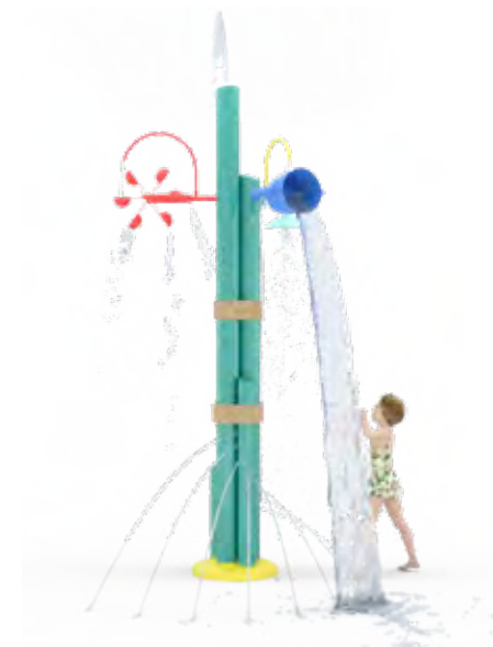
Activity Piling Cluster